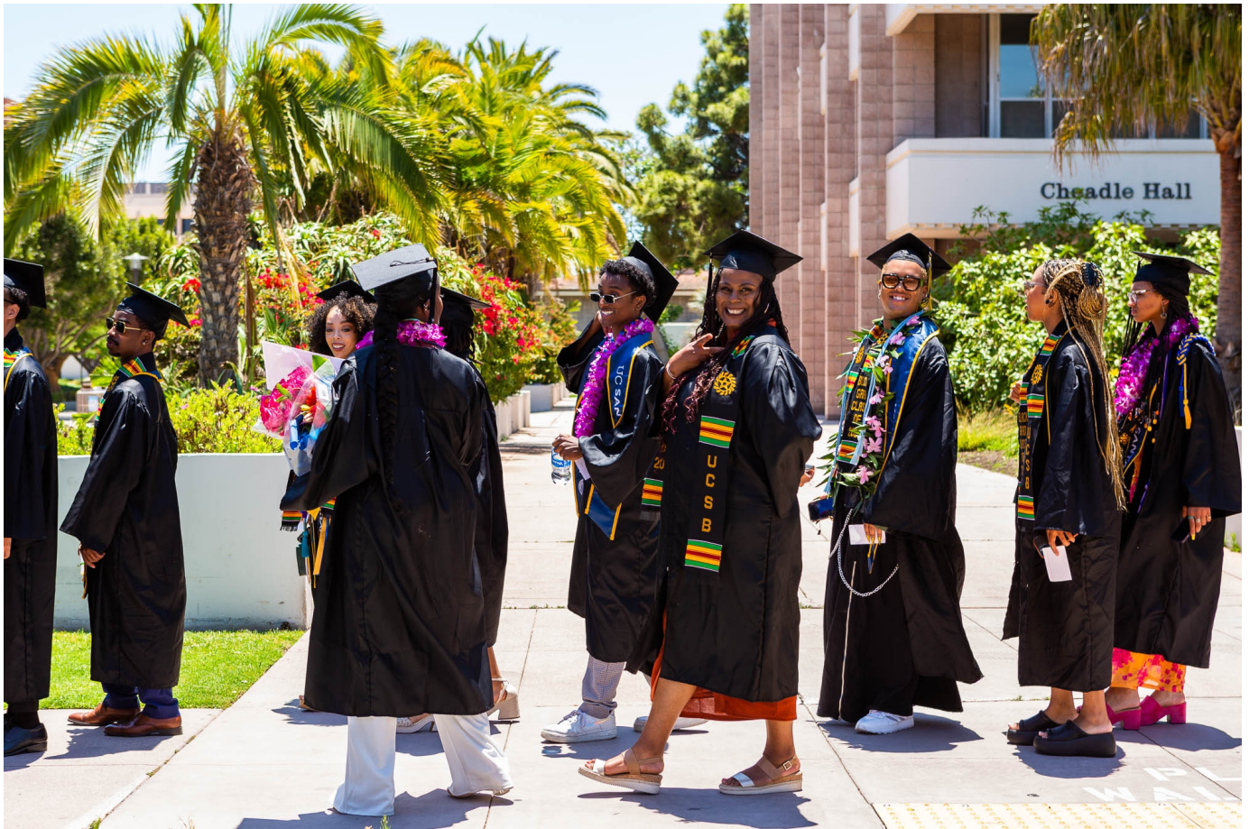
UC Santa Barbara Commencement 2023 Image