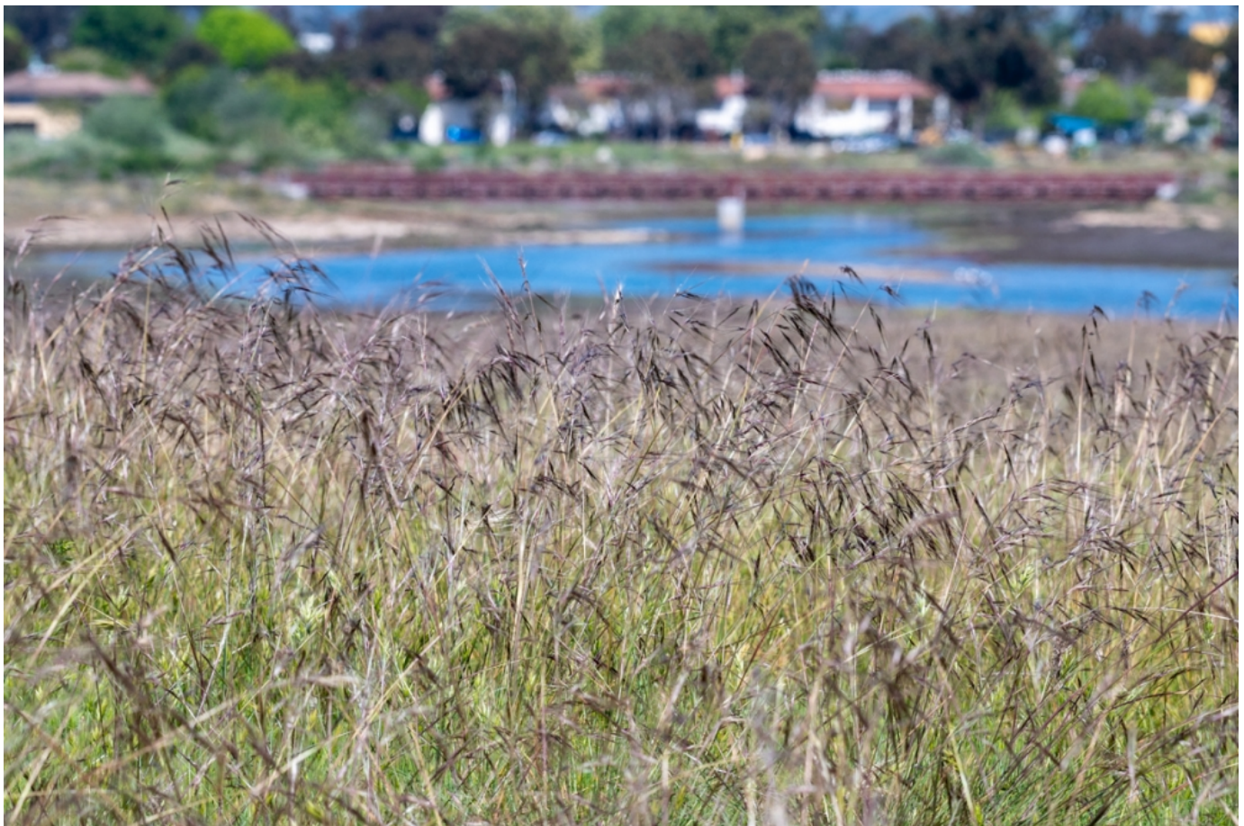
Restored native grassland off the Mesa Trail.

North Campus Open Space also provides a home to the endangered Crotch's bumblebee, which is purportedly thriving amongst the Ventura marsh milkvetch, an endangered plant practically revived from extinction. The Cheadle Center is part of an effort to reestablish this plant , which had disappeared from 1967 to 1997, and NCOS now hosts over 2,000 individuals.