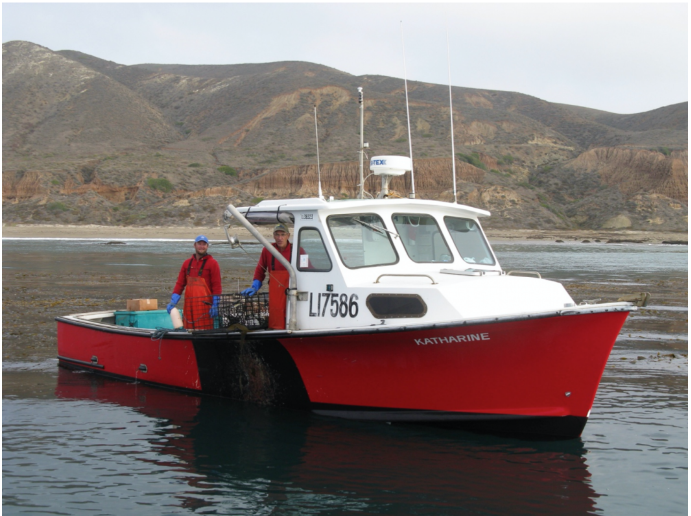
Lobster fishermen prepare to set traps off the coast of Southern California.