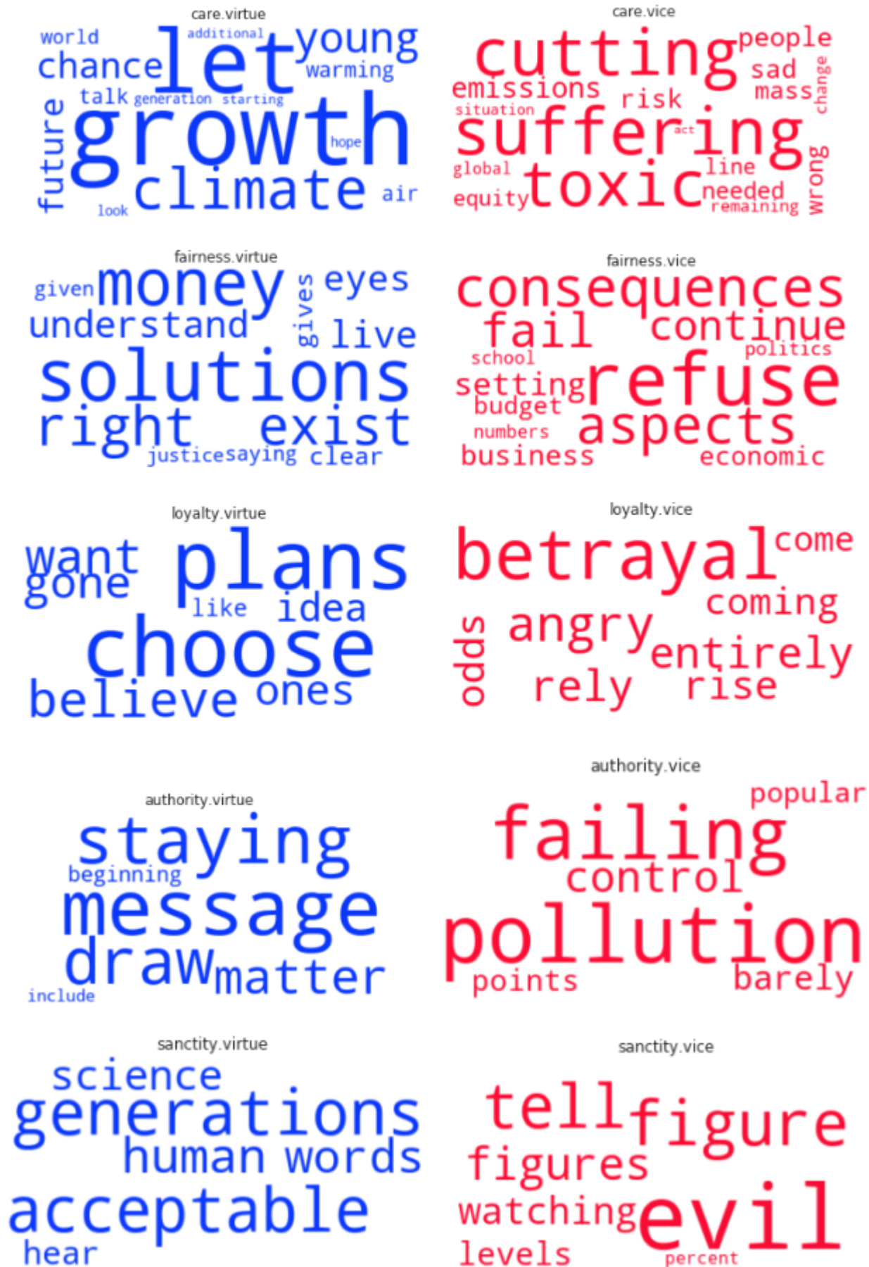
Figure 3. Moral versus Immoral Language