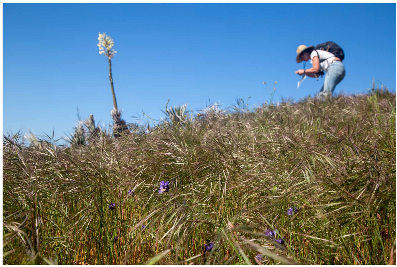
Purple blue dicks peak through the tall grass as new growth emerges from blackened yucca. Image