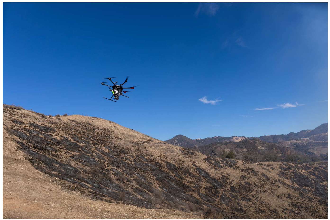
Aerial Ignition drones can drop incendiaries into the center of a fire, providing unprecedented control to burn teams.