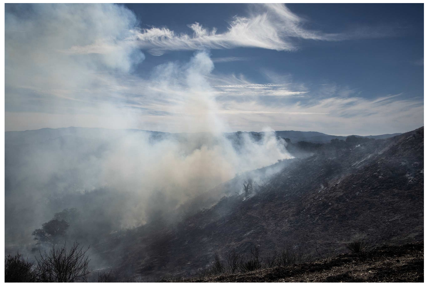
The fire dies and only smoke remains, returning the colors of the landscape to dull gray and brown. Previous Next

Acknowledging that burning any vegetation releases carbon dioxide, Davis said, "The question is, 'How would you like vegetation to burn?' Burning is an inevitable feature of these landscapes. But with prescribed fires, you're burning under more moderate, controlled conditions."