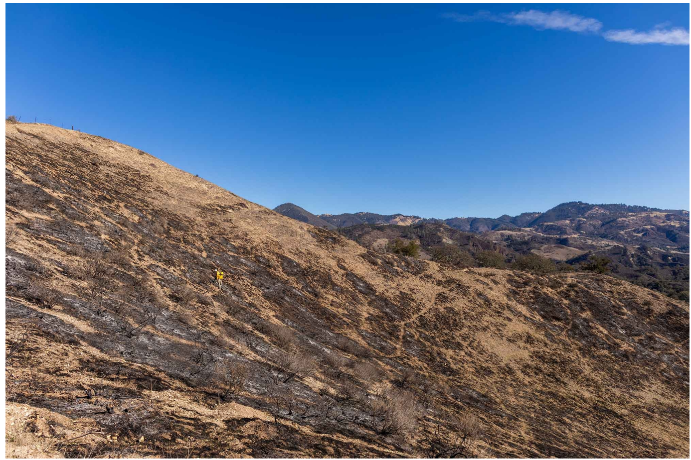
Photo Credit Matt Perko A prescribed burn three days prior scorched the hillside to the north. Image