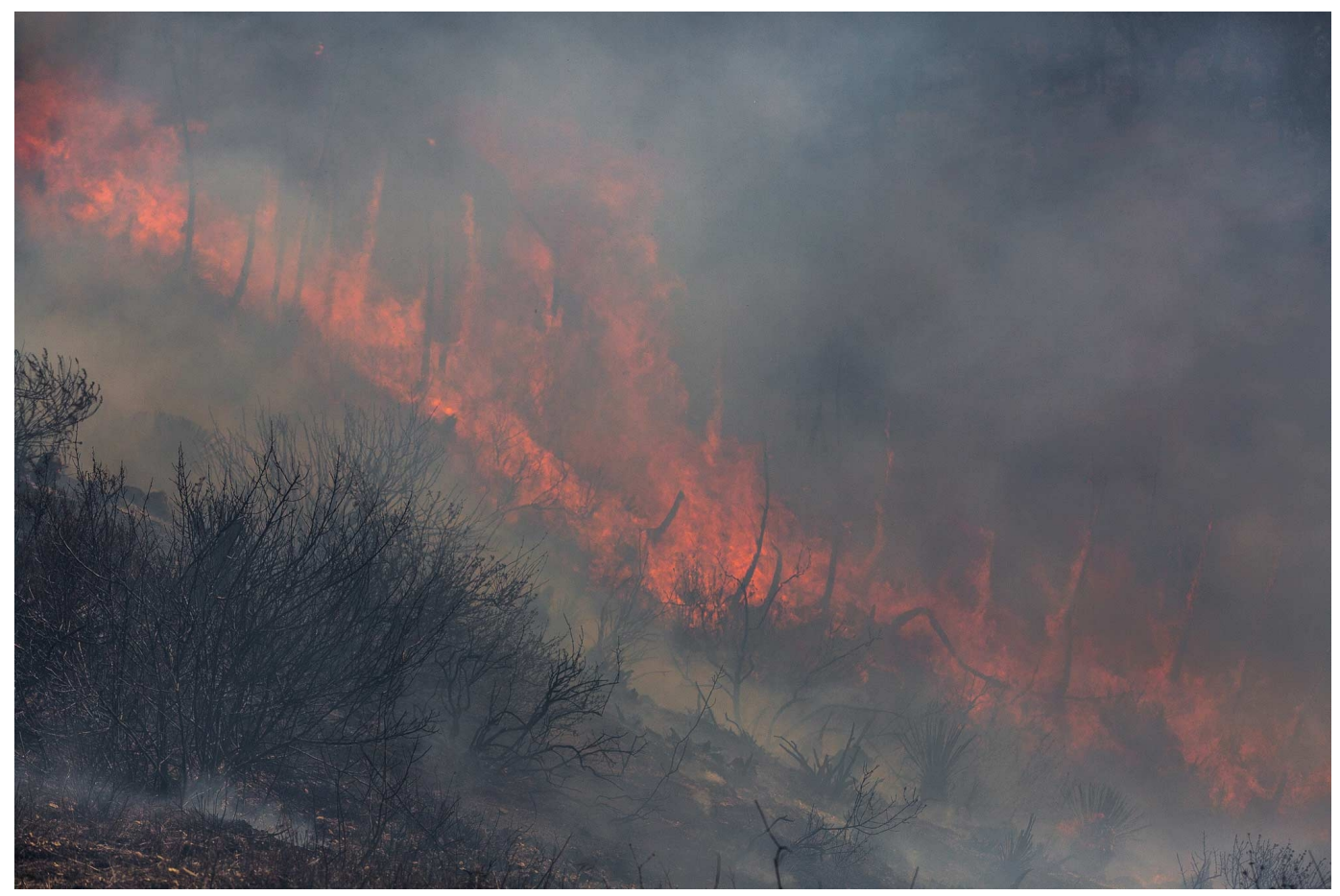
Flames engulf the hillside, providing a stark image of the future that prescribed burns aim to avoid. Image