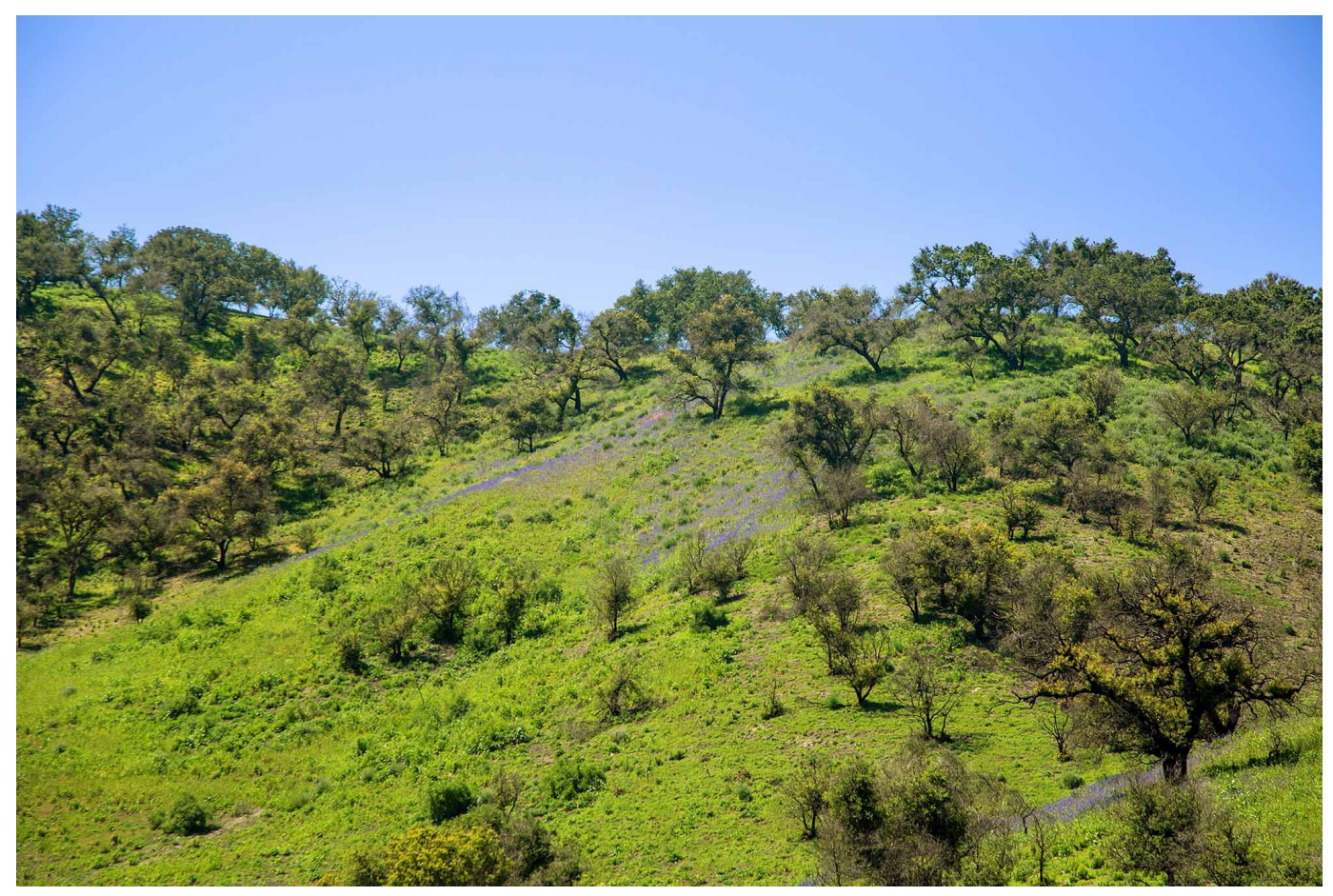
A wet winter brings life back to burned hillsides. Image