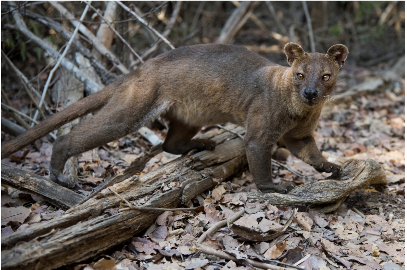
A fosa, Cryptoprocta ferox .

the team nearly doubled the number of reliably radiocarbon dated traces of past human activity from the island.